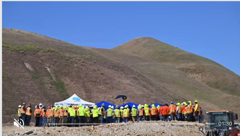
See giant solar project under construction near Patterson

2009 was our 10-year anniversary and we wrote about not allowing urban use in the ag buffer north of Turlock. We highlighted the need for “Rethinking the North County Corridor.” The subsequent public outcry to “make Kiernan work” became reality and Kiernan Road continues to be the main four-lane divided corridor on the east side of the county.