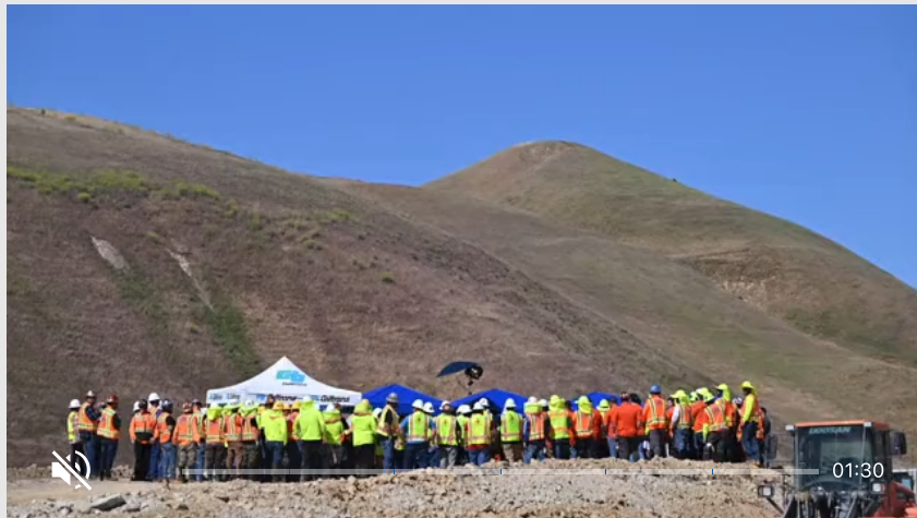
See giant solar project under construction near Patterson

Patterson recently won approval from Stanislaus Local Area Formation Committee to urbanize 1,119 acres of prime farmland along the I-5 corridor. This was approved despite the recommendation against approval from county staff that correctly identified the likely inability of Patterson to adequately provide for a multitude of negative impacts – providing water, sewer capacity and alleviating resulting traffic congestion. These issues were not merely ignored but consumed by the grandiose development projections for job-generating businesses.